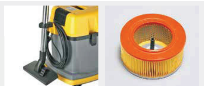
New fixing system

Compact, powerful, economic and manageable model. Exhaust air filter Possibility to have 2 versions: FT (with polyester filter) and FC (with standard cartridge filter and paper filter bag). Possibility to connect to electric power brush. Equipped with anti-shock bumper. Energy efficiency class: A.