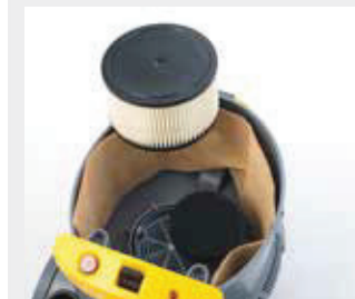
Motor protection filter + cartridge filter