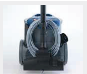
New fixing system