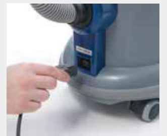
Socket for power brush