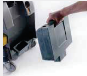
Two types of lithium batteries available (10 Ah and 20 Ah)