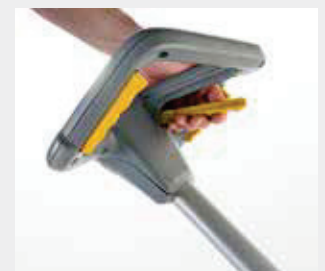
Ergonomic handle with unlocking system