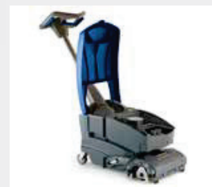
Fast and easy maintenance