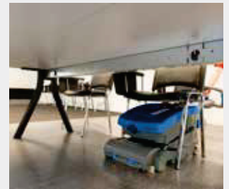
Compact dimensions to go and work where no one arrives