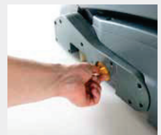
Adjustable down pressure by knob (3 steps)