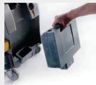
Two types of lithium batteries available (10 Ah and 20 Ah)