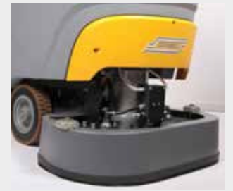
Twin brush deck