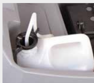
Chemical mixing system