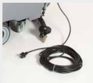
25 m cable as standard