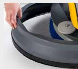
Detachable brush deck splash guard with bristles