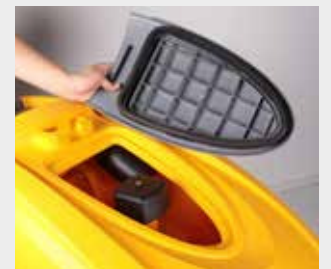
Debris tray + vacuum filter