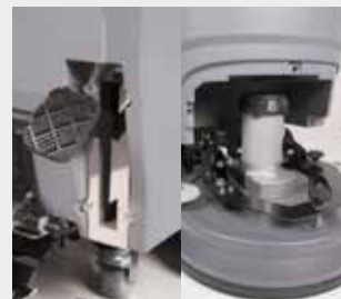
Double brush pressure (by pedal)