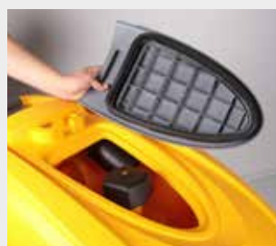
Debris tray + vacuum filter