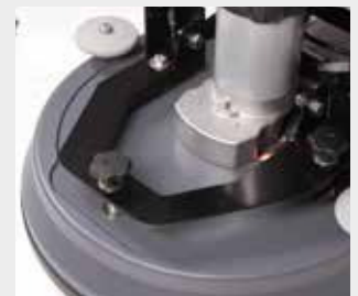
Double knob for brush regulation