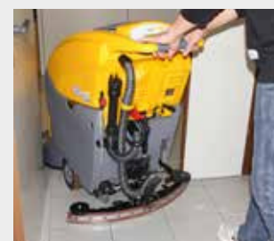
Adjustable and compact squeegee