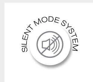
Ideal for day cleaning