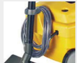
New fixing system