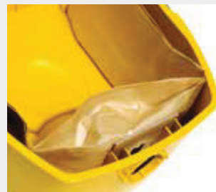
Paper filter bag